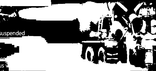
Cement pollution Can dramatically alter the chemical composition of surface waters.